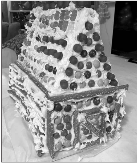
This house/barn is made of pretzel rods and graham crackers and a lot of frosting.