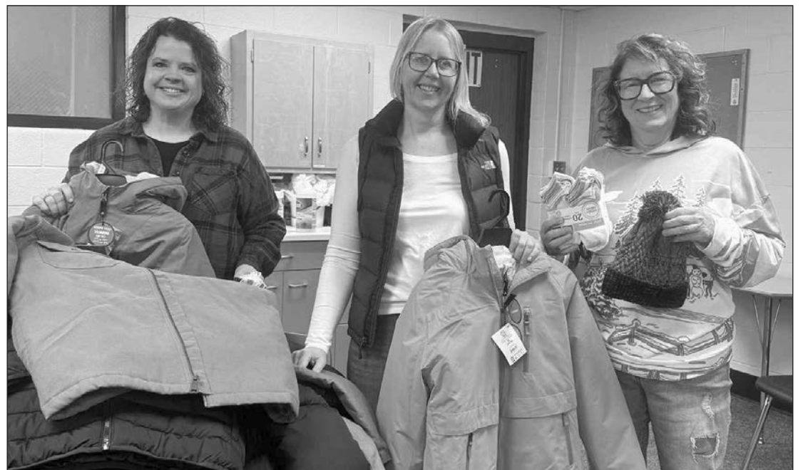
As part of a collaboration with Crookston Public Schools, the Crookston Area Community Fund provided winter clothing and necessities for students. Pictured are (from