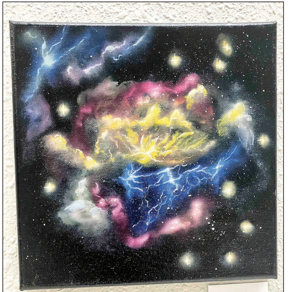
"Galaxy," a painting by Sarah Pester, is among the pieces on display now through mid-April at the Historic Fournet Building in downtown Crookston. (Submitted)