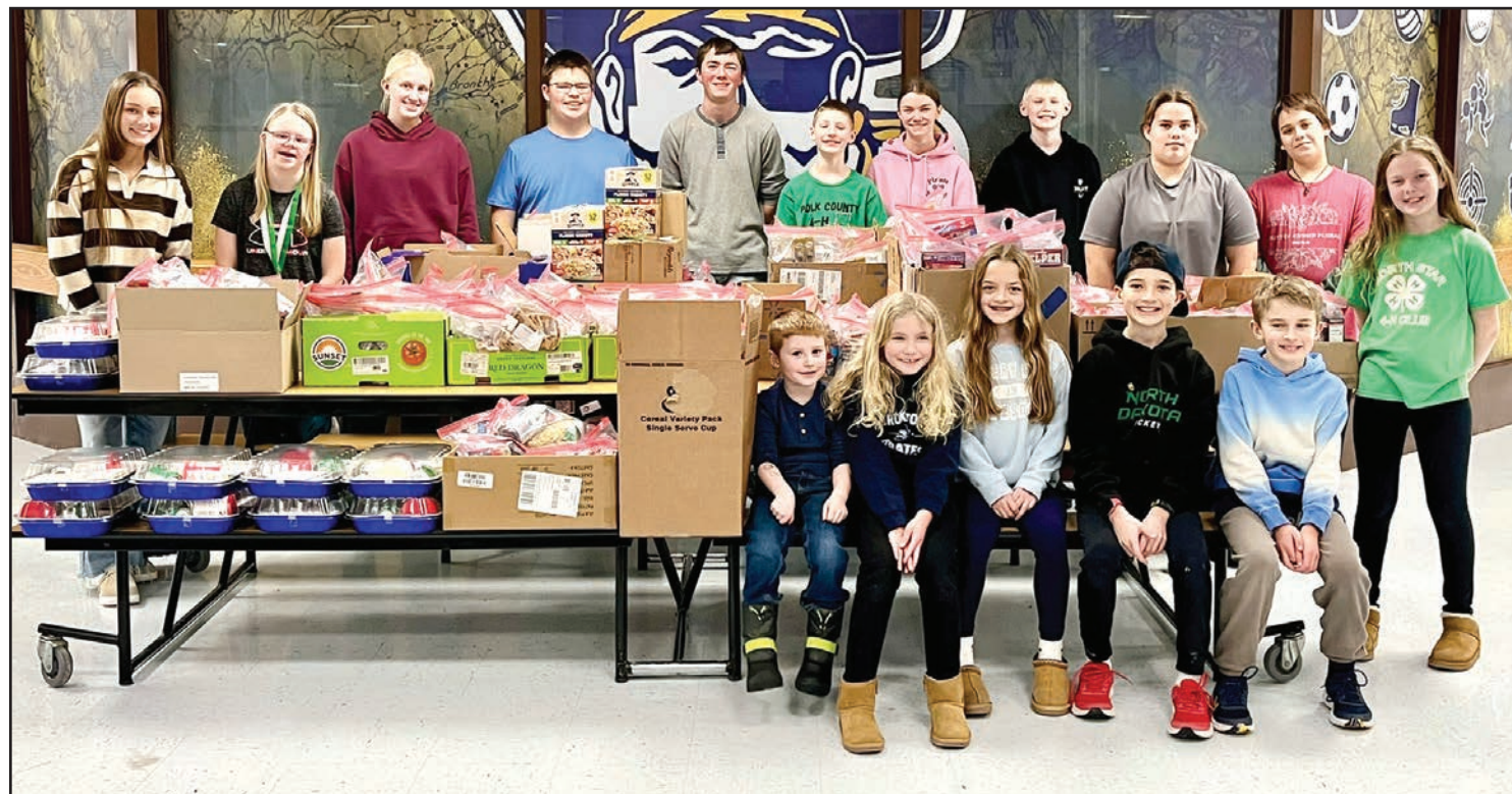
North Star 4-H Club members are pictured after packing 254 meal kits to help with food insecurity at Highland Elementary

Crookston Public Library, participating in a Mystery Meal planned, prepared, and served by the sixth grade class; and the annual battleball tournament. Learning about mission work in Mongolia and swimming at the Crookston pool rounded out the week.