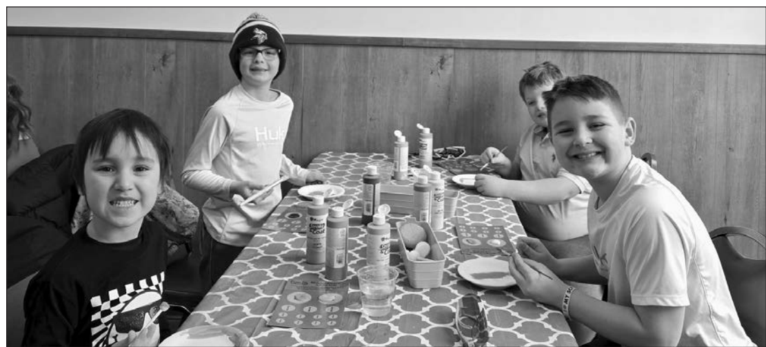
Our Savior's Lutheran School students painted pottery at Queen City Arts Center as part of National Lutheran Schools Week.