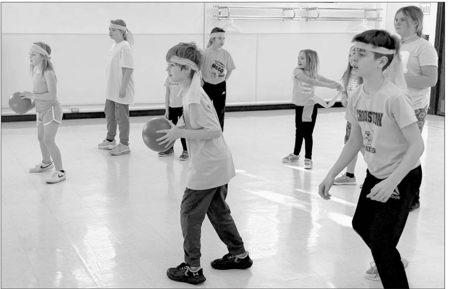
The annual battleball tournament was held at Our Savior's Lutheran School recently. The tournament was part of the