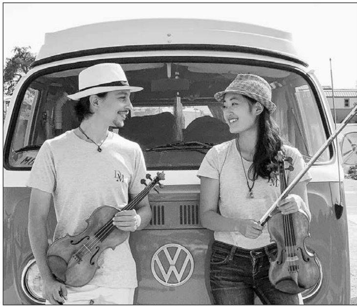
MusiKaravan will perform Friday, Feb. 20 at 7 p.m. at Crookston High School.