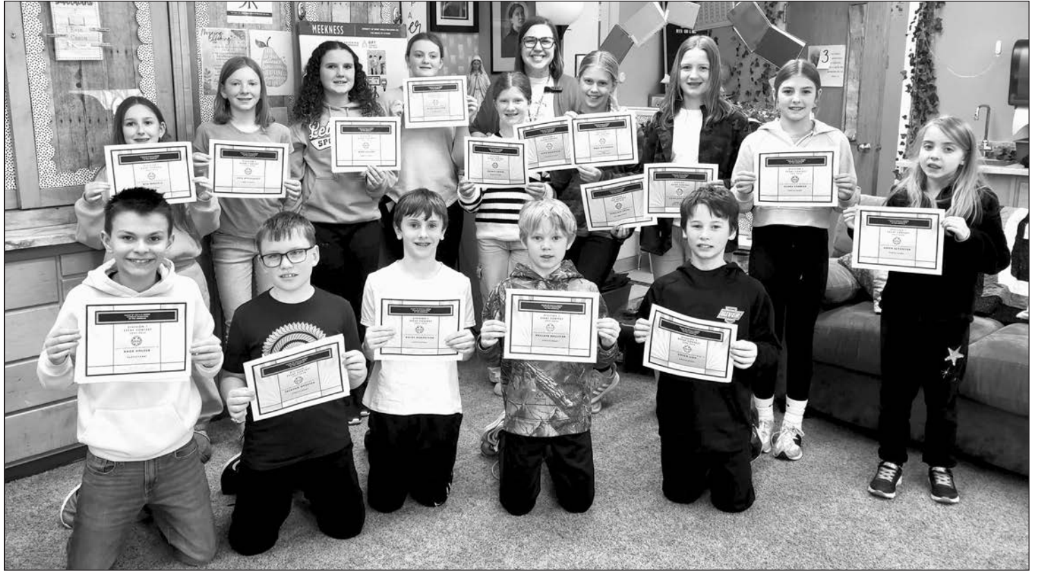
Cathedral School fourth and fifth graders who participated in the 2025-26 Catholic Daughters Essay and Art Contest were sponsored by Court St Cecilia Catholic Daughters from Court #2025 in Red Lake Falls. The students showed their

Thursday, Feb. 26 ■ Wrestling - MSHSL State Tournament Day 1 Friday, Feb. 27 ■ Basketball - Crookston Boys vs. Kittson County Central 7:30 p.m. ■ Wrestling - MSHSL State Tournament Day 2.