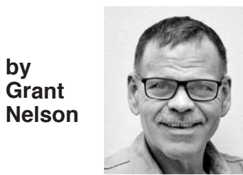
by Grant Nelson

What is antique, collectible or just old? I can remember a time when carnival glass was highly valued on the antique market as was heirloom china serving sets. I think this has changed over time as those who once prized these items pass and their children find value in more contemporary possessions. Tractor values are an even greater question to me. I have dabbled in tractor ownership and typically purchased a tractor for the work it could do while most saw the same tractor as suitable only for a parade due to its