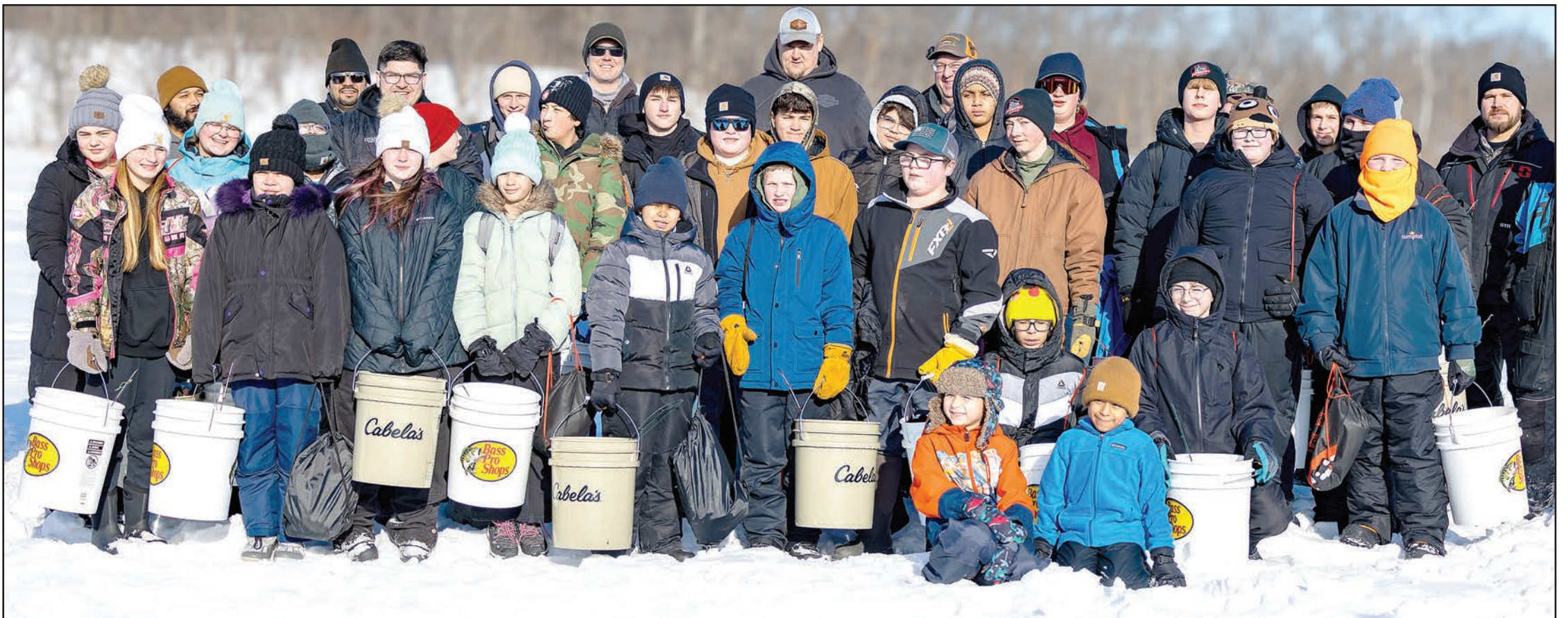
Get Kids Outdoors held its annual ice fishing day Saturday, Jan. 31. Each participant received their own ice fishing pole, tackle box and tackle to keep.