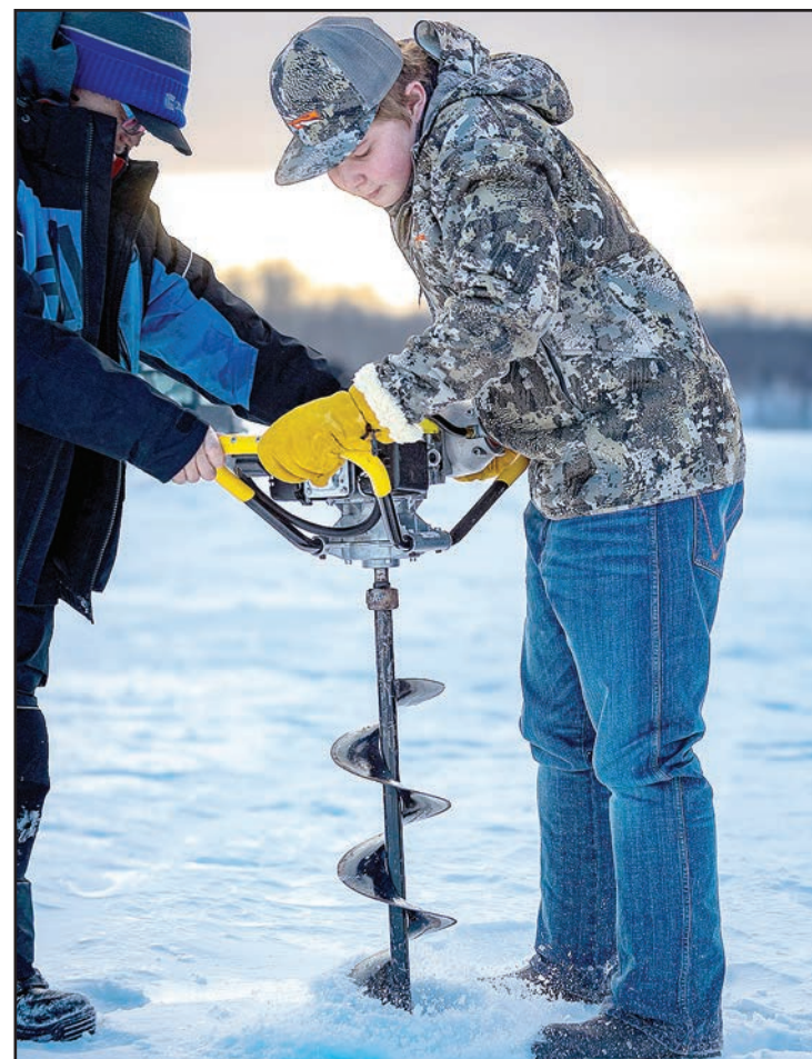
Kids experienced the various aspects of ice fishing while participating Saturday, Jan. 31 in Get Kids Outdoors' annual ice fishing day.

The council approved another temporary extension of the liquor license for the Crookston Inn. The council previously approved a temporary extension Dec. 29, 2025, while the property sale was finalized. The closing date has been delayed and is now expected on or before Feb. 27, 2026. The additional extension allows the business to continue operating during the transition. The extension is for an additional 45 days.