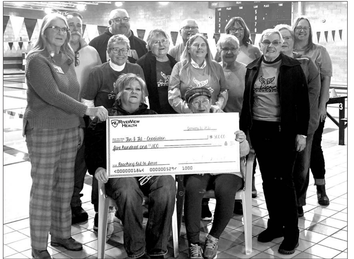
RiverView Health recently donated $500 to Fin and Fit for the Crookston Community Pool. (Submitted)

Often times, I see a backhoe pulling topsoil out of the ditch in the spring. This is that same snirt after the snow has melted and left the