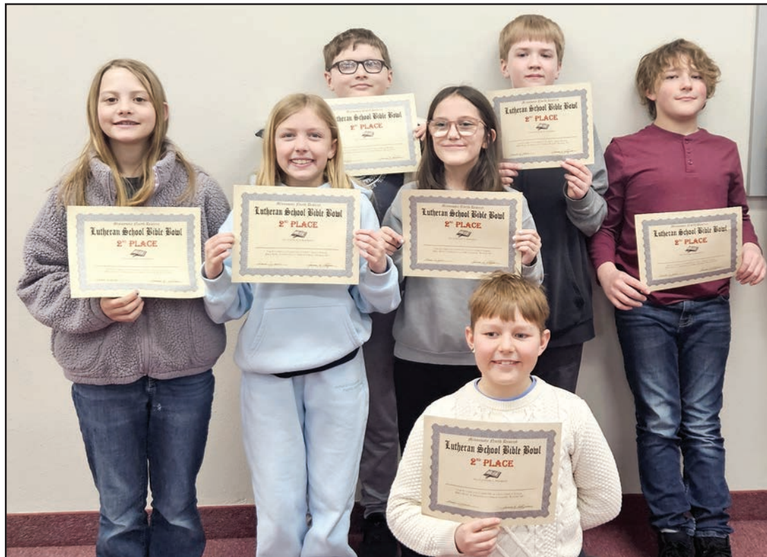
Seven students from Our Savior's Lutheran School in Crookston competed in the Minnesota North Lutheran Schools Bible Bowl competition Saturday, March 7 at Immanuel