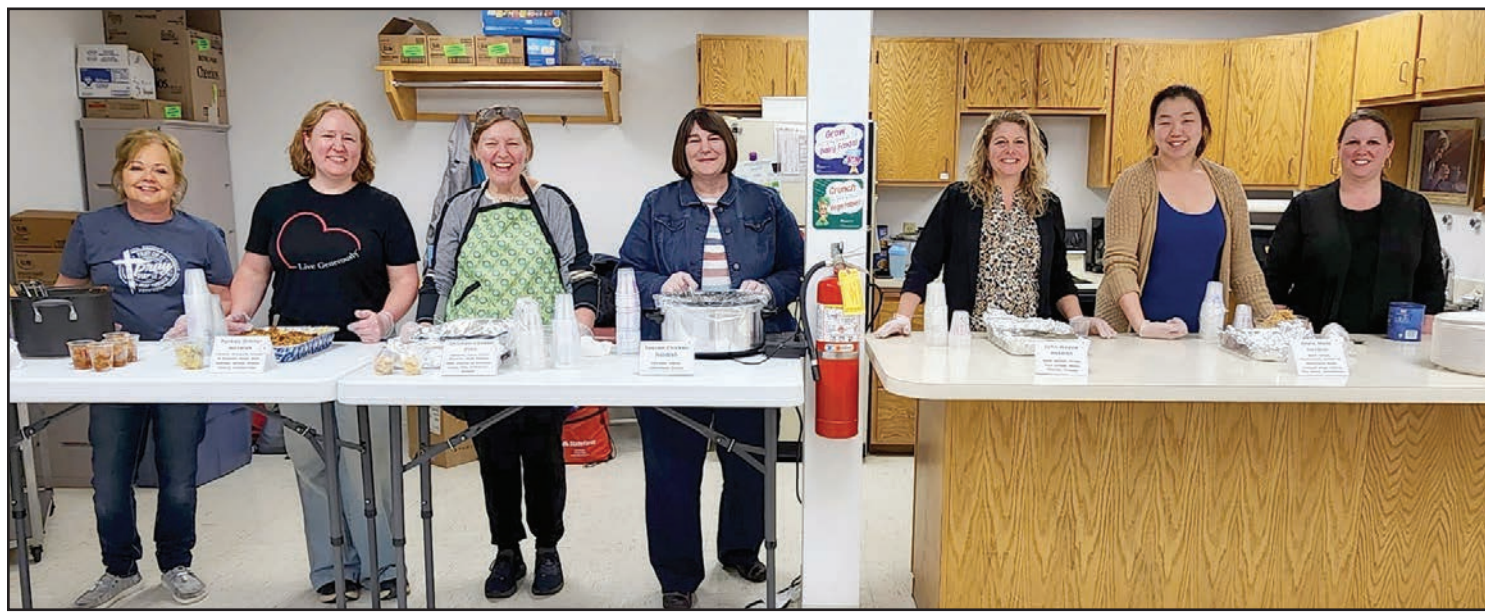
Our Savior's Lutheran Church and School held their annual staff hotdish competition on Wednesday, March 18. This