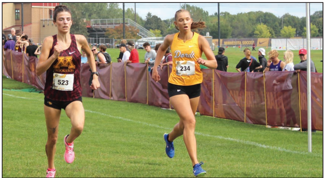
The University of Crookston announced Monday that it was adding men's and women's track and field as an NCAA Division II sport with competition beginning in the 2026-27 season. The Golden Eagle men's and women's cross country runners have been competing at indoor and outdoor track and field meets as unattached runners in recent years. This will allow those runners to officially represent their school at meets, and run as a part of NSIC Indoor and Outdoor Championships.