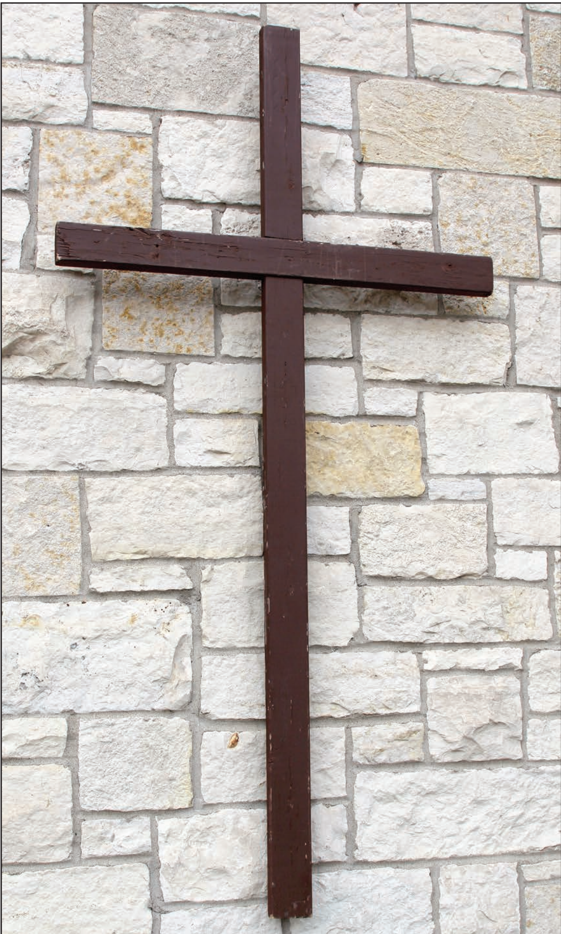
Sunday marks Easter, a Christian holiday that celebrates the resurrection of Jesus Christ three days after his crucifixion. This photo was taken outside of Zion Lutheran Church in Thief River Falls.

324 Main Ave. N., Thief River Falls, MN 56701 • Vol. 2, No. 27