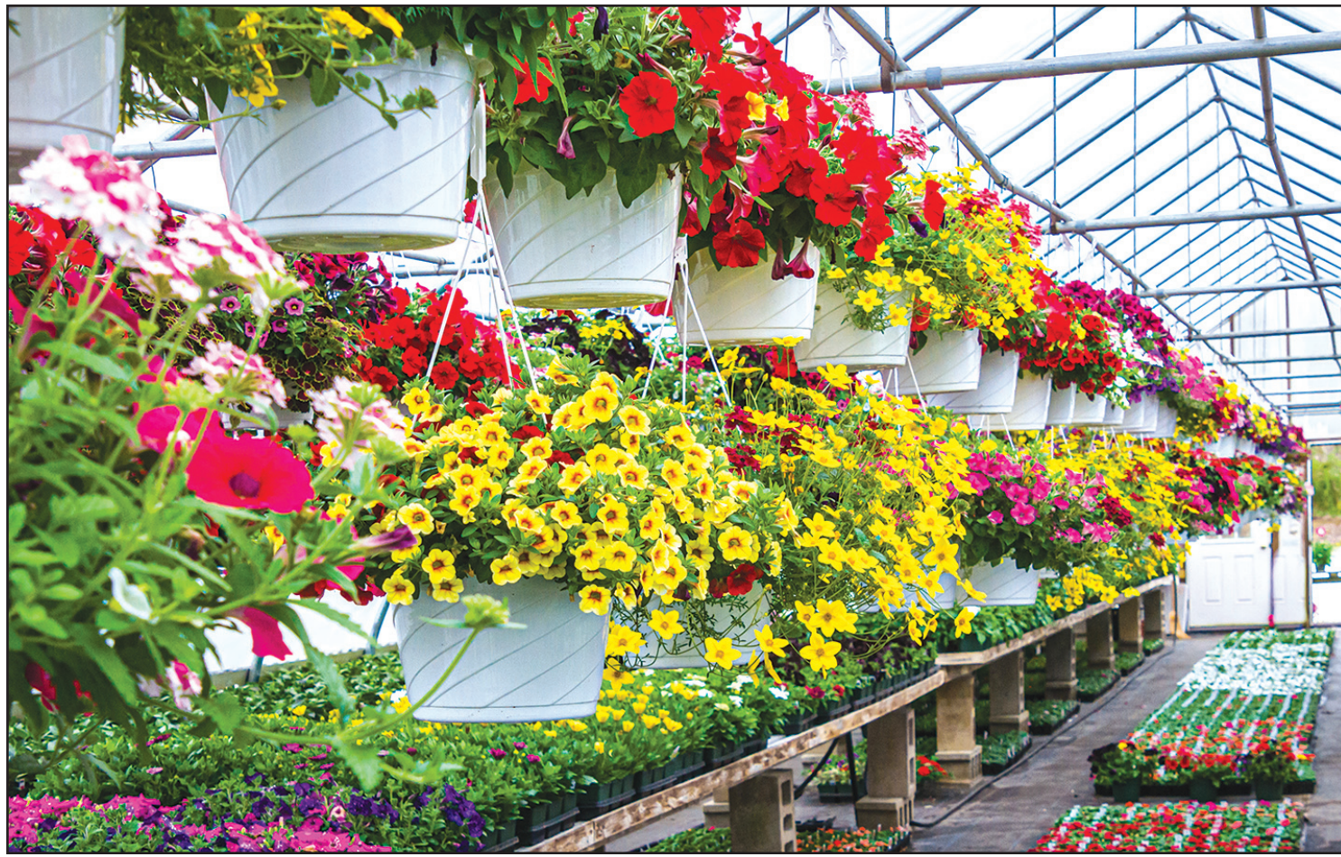
Flower gardens are one way to add beauty to a property. Gardening centers can provide various tips to those starting a flower garden or a vegetable garden.