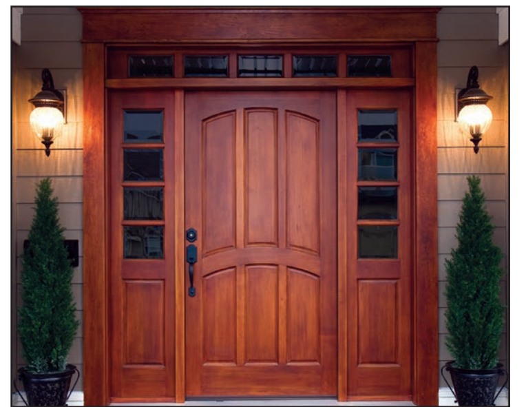
A new entry door is one way to increase curb appeal.

Home gardens can yield many gifts, from flowers to fruit. Beginners can utilize some time-tested strategies to increase their chances of planting a successful garden.