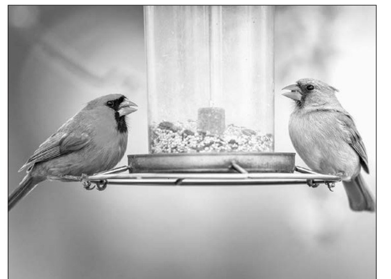
About 50 million Americans engage in bird feeding each year. It's important to choose quality foods to ensure health and survival when feeding birds.

Choosing nutrient-dense, high-quality seeds and fats and maintaining a clean feeding station can ensure that a backyard remains a haven for wild birds. Those with additional questions about what to feed birds should consult with a wild bird food retailer.