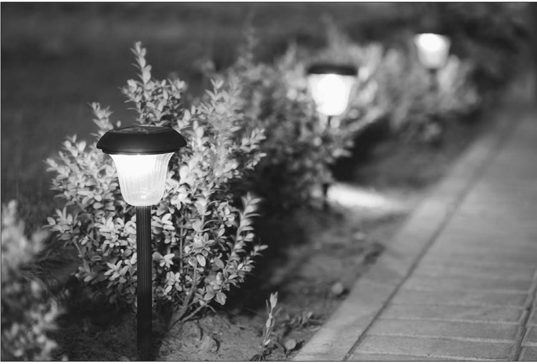
Landscape lighting is growing in popularity. It increases security and draws attention to various landscaping features.