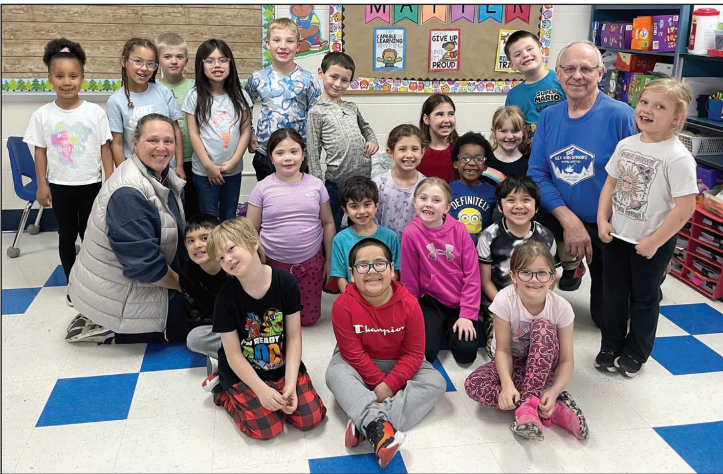
Thanks to Get Kids Outdoors, Highland Elementary School first graders had an incredible day of nature-based learning. They planted pumpkin and gourd seeds, ate "edible soil" dirt cup snacks, conducted a thorough soil investigation, and