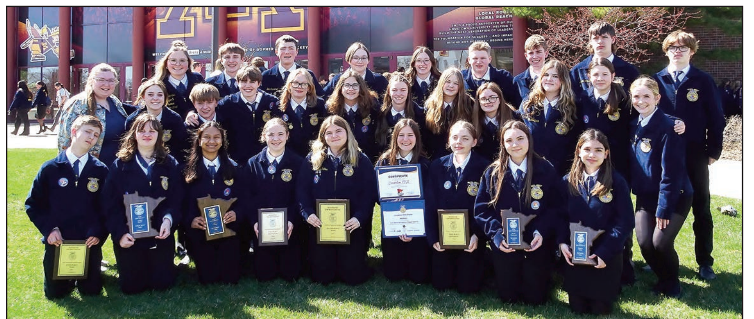
Twenty-nine Crookston FFA students competed April 19-21 at the 97th Minnesota FFA State Convention.