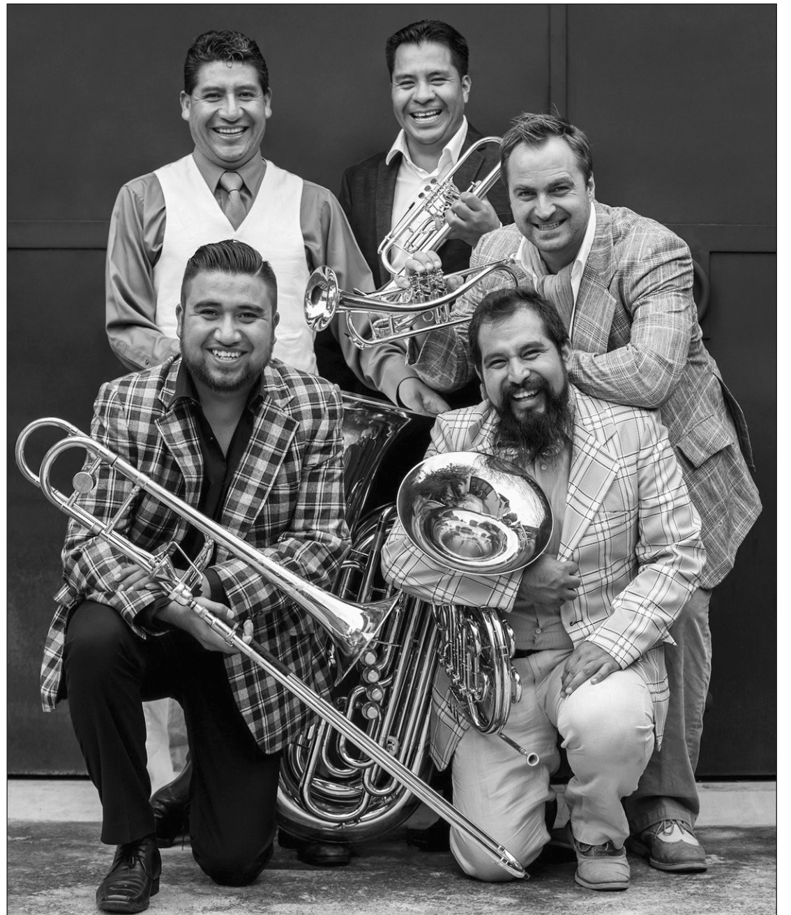
M5 – The Mexican Brass will perform Saturday, May 16 at 7 p.m. at the Crookston High School auditorium. The performance is the final concert in the 2025-26 Entertainment Series.