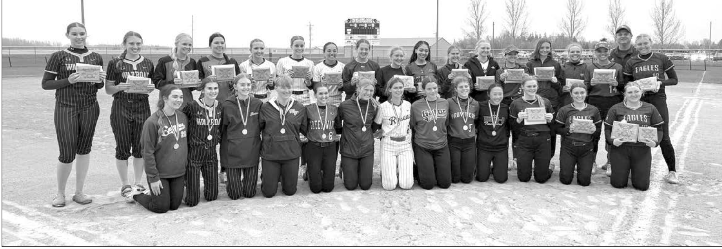
Agassiz Valley All-Conference and All-Conference Honorable Mention selections were announced prior to the conference championship game Thursday, May 14 in Thief River Falls.