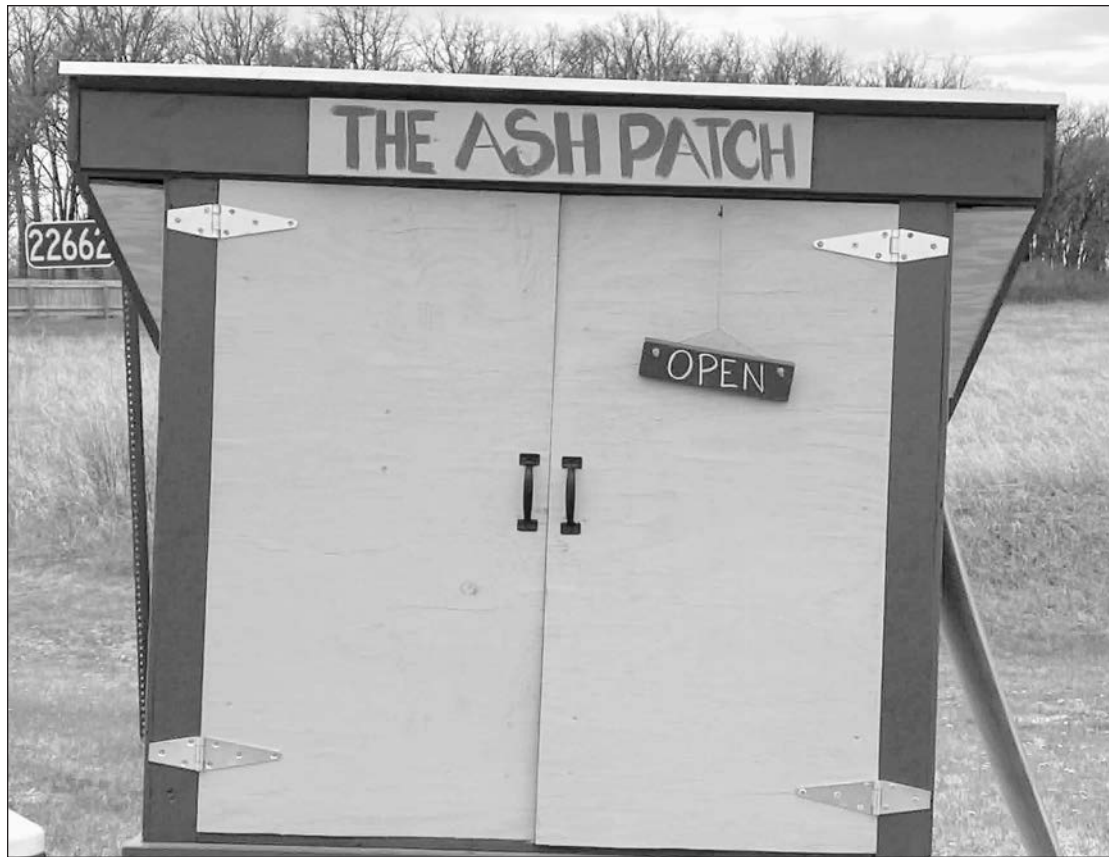
"The Ash Patch" is among the unattended stations that have cropped up. It is located east of Viking and north of Lilac Ridge Mobile Home Court. (Submitted)