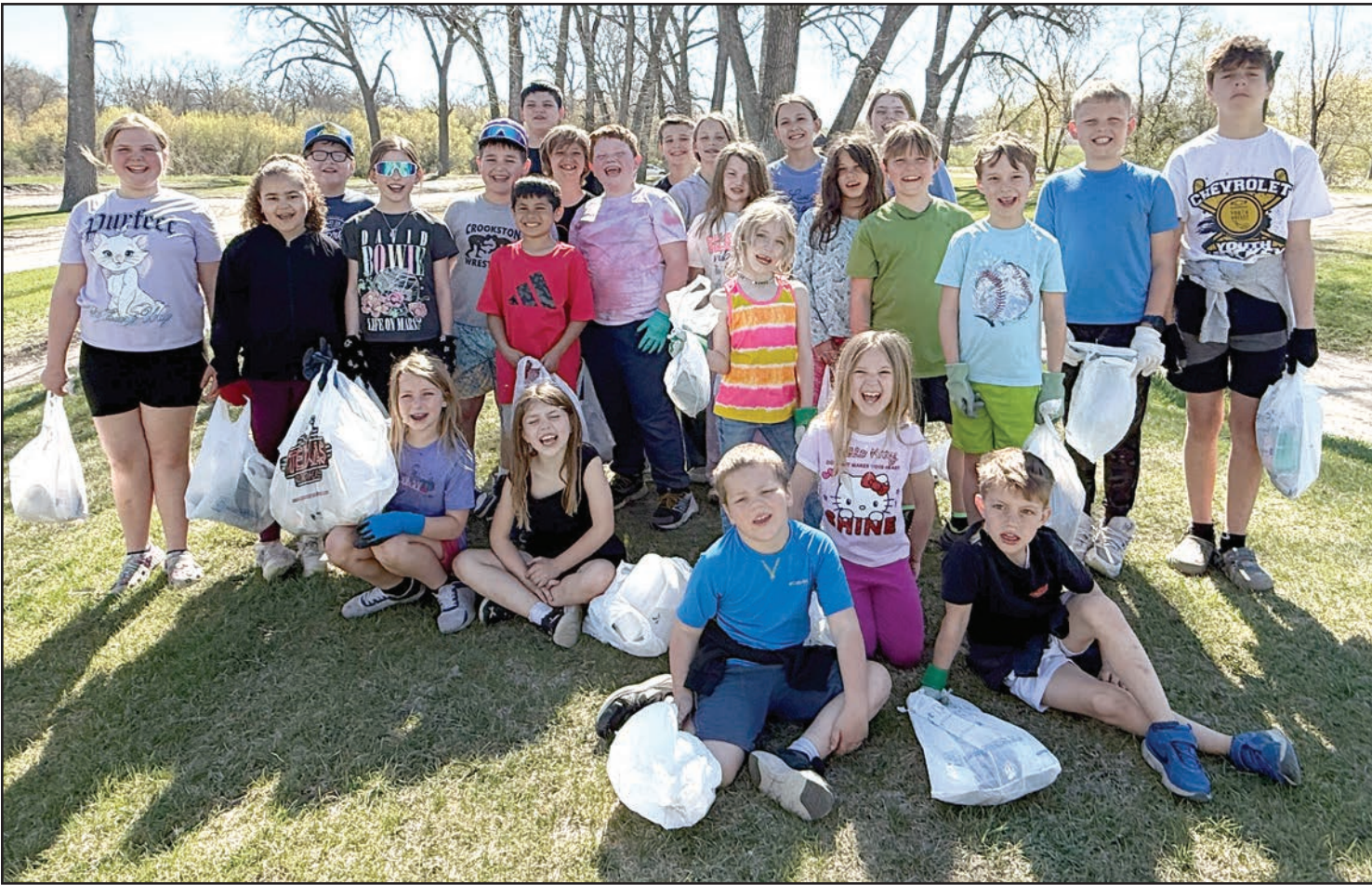
Students from Our Savior's Lutheran School participated in their annual Community Clean Up Day on Wednesday, May 13. In an effort to give back to their community and help care