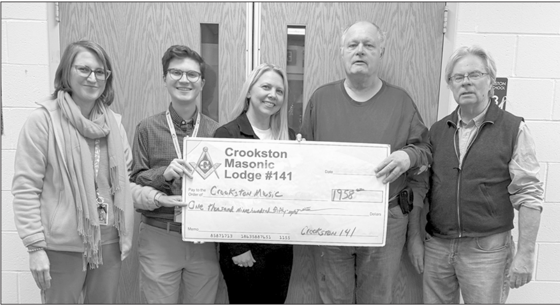
The Crookston Masonic Lodge recently presented Sunday morning breakfasts at the Lodge Building, 112 W. Robert, to support various groups. One of those breakfasts