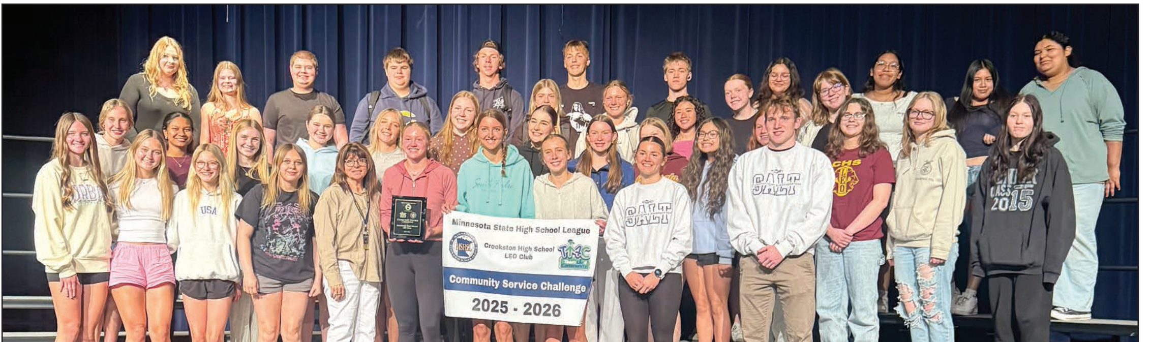
The Crookston High School Leo Club received the Community Service Challenge 25-26 from the Minnesota State High School League in partnership with Team Up 4 Community and SALT – Student Advisory and Leadership Team. This is first time that the MSHSL has awarded this honor, and the CHS Leo Club is the first recipient of this award, which recog-