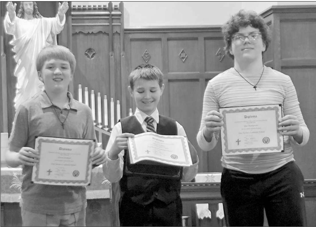
Our Savior's Lutheran School held its sixth-grade graduation on Wednesday, May 20.