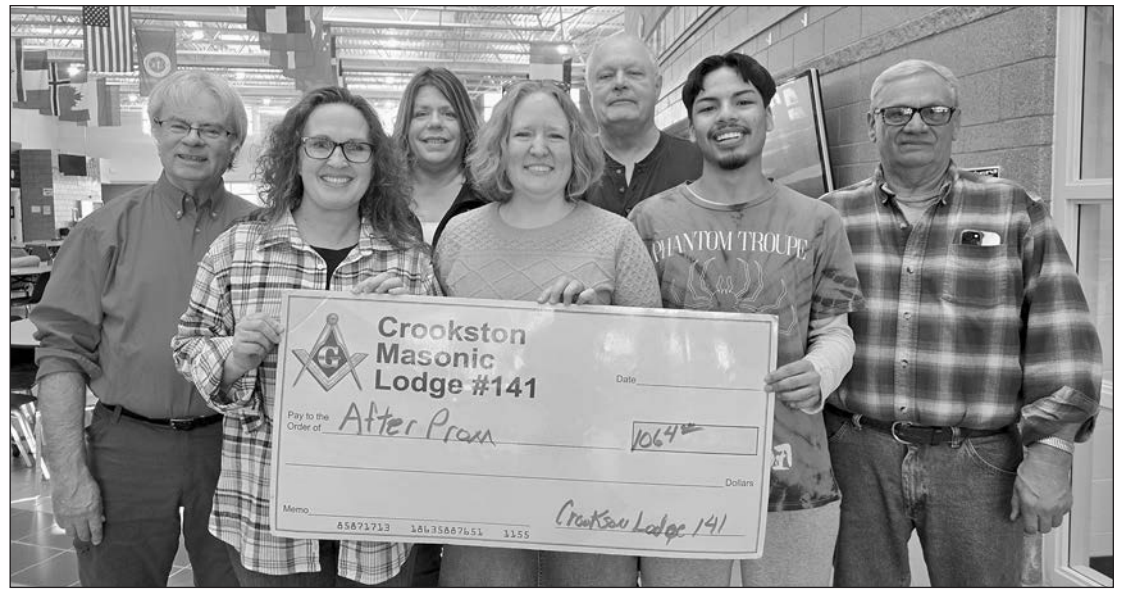
Crookston High School After Prom activities recently received funds from the Crookston Masonic Lodge, which held a breakfast ben-