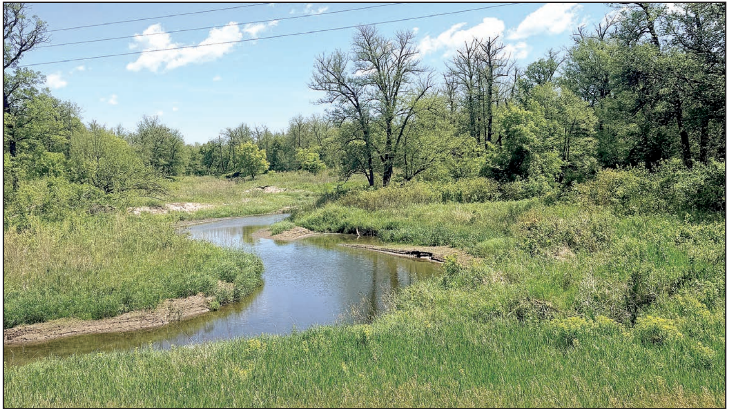
A stretch of the Sand Hill River is poised to shed an impairment for fish habitat. The Minnesota Pollution Control Agency is accepting comments through Wednesday, July 22 on the proposed delisting.

For those interested in more opportunities to get outdoors and connect with others, organizers also encourage residents to take part in the weekly Wellness Walk. Held each Wednesday at noon, walkers meet at the Main Street Courtyard across from True Value and follow an approximately one-mile route through downtown Crookston.